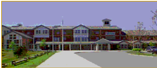
Bradford Elementary School