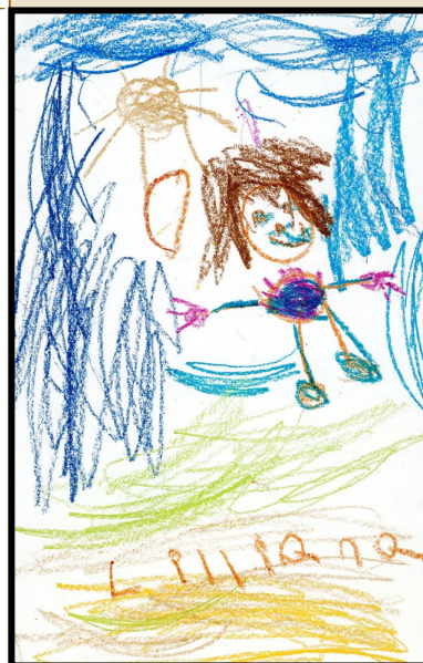
Lilliana Tilton Elementary School - K